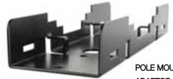
POLE MOUNT ADAPTOR

Available in black or white, the pole mount adaptor kit for the Tannoy Di yoke or K-Ball™ installation brackets is designed to facilitate simple pole mounting of Di speakers in a wide range of applications indoors or out.