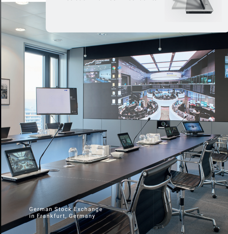
German Stock Exchange in Frankfurt, Germany

Streamline meeting control with this all-in-one, convenient and web-based meeting management solution.